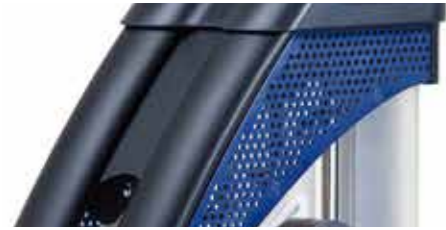
BLUE PANTONE 287C

*Speak to your sales representative for cost and lead time information.