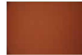
Flame Orange #4