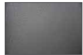
Sterling Gray #1