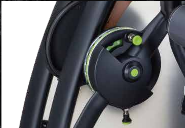
Specially designed cams follow an appropriate strength curve to match load and joint position—providing a more efficient workout.