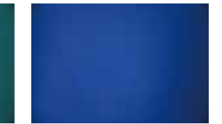
Sea Blue #7