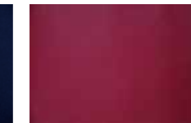
Plum Red #43