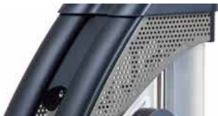
SILVER PANTONE 877C