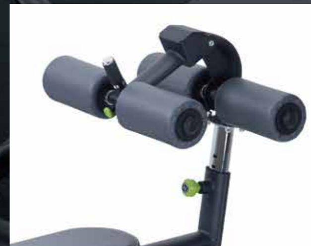
Multiple adjustment points for user convenience and comfort.