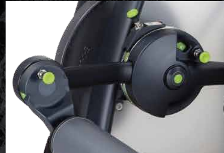
Range limiting devices allow for the perfect unit setup—ideal for rehabilitation or sport-specific training.