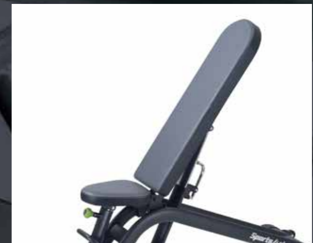
Contoured and molded seat pads provide comfort and ergonomic support for a variety of movements. Marine grade upholstery is tear resistant and available in a variety of color combinations to compliment any gym decor.